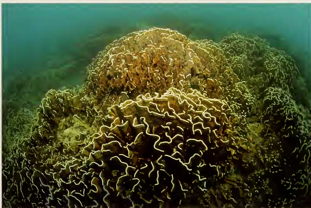
Figure 10. Large stands of healthy blue coral Heliopora coerulea at 3 m water depth off the north coast of Aceh Province, October 27, 2005.

The reef was characterised by 31% rock and equal proportions of live coral cover and rubble (21% each). Moving further east, the final survey in this area displayed minimal signs of tsunami damage. Although one tree branch was observed on the reef, no coral had been killed, broken or overturned and the reef displayed large stands of healthy blue coral Heliopora coerulea (Fig. 10) and Porites spp. Live coral cover accounted for 35% of the substrate.